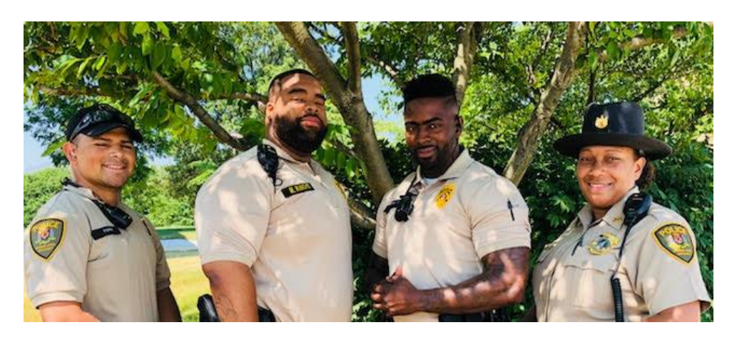
Morgan State University Police Department: Who Are We?

Morgan State University (MSUPD) is open 24 hours a day, 365 days a year. The telephone number for emergency calls is 443-885-3103. The telephone number for routine business calls is 443-885-3100. The Police and Public Safety consists of sworn and commissioned Police Officers who have statutory powers of arrest and Public Safety Aides (University Security Guards) and contract security guards dedicated to providing best in class service to the community. Officers patrol the campus on foot, by bicycle, and in motor vehicles. Several officers and a supervisor are on duty 24 hours a day. The Communications Center is staffed with trained dispatchers who receive calls for service, dispatch officers to respond to emergency calls for assistance and qualifying incidents, and monitor intrusion detection and fire alarms. MSUPD staff also carries out a variety of roles, including operating the campus escort program.